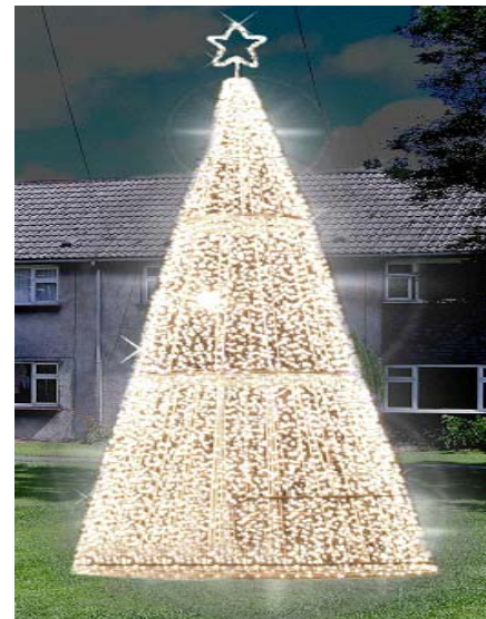
Christmas at Tibshelf

DATE FOR YOUR DIARY TUESDAY -1ST DECEMBER