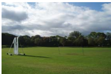
Rutland Road Sportsground